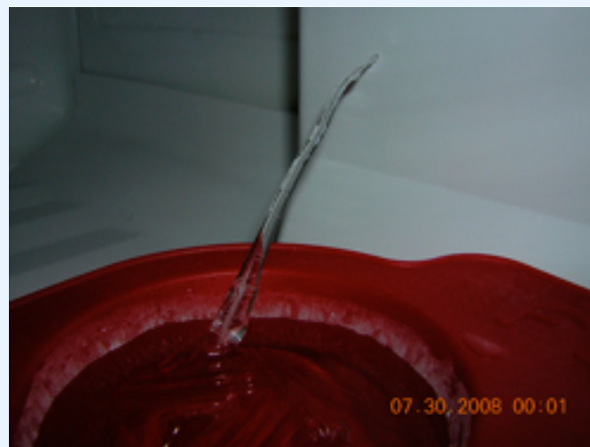
Reach Out & Touch