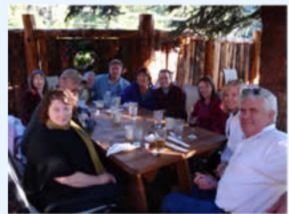
Dinner in Polson