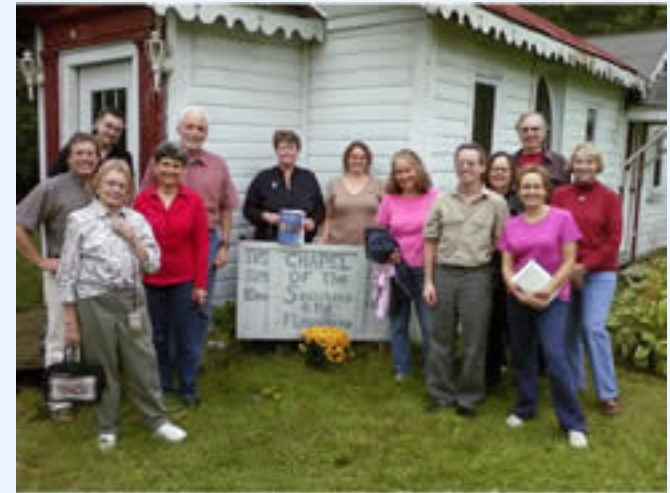
The Wisconsin Group