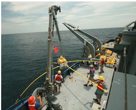
prepare to deploy an electromagnetic instrument during a mission aboard R/V Melville off Nicaragua.

Hidden magma layer could play a role in earthquakes and other aspects shaping the geological face of the planet